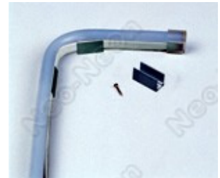
4. 90° Installation

Includes: 1. Mini channel LN-FX-5 2. Screw