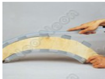
6. Convex installation

Includes: 1. Mini channel LN-FX-5 2. Screw