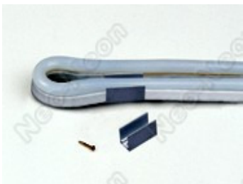
5. 180° Installation

Includes: 1. Mini channel LN-FX-5 2. Screw