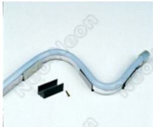
3. Curve installation

Includes: 1. Mini channel LN-FX-5 2. Screw