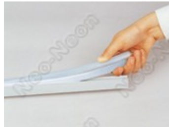
2. Linear installation

LN-FX Must be cut only on the indicated mark