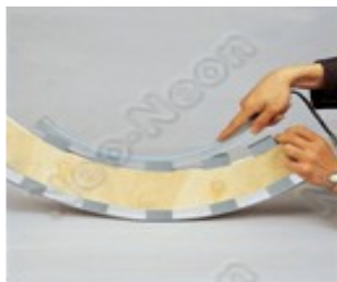
7. Concave installation