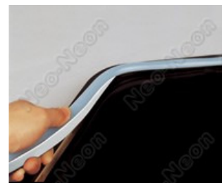
8. Installation with the slot

Press LN-FX into the slot of the installation