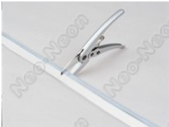
1. Cutting mark

LN-FX Must be cut only on the indicated mark