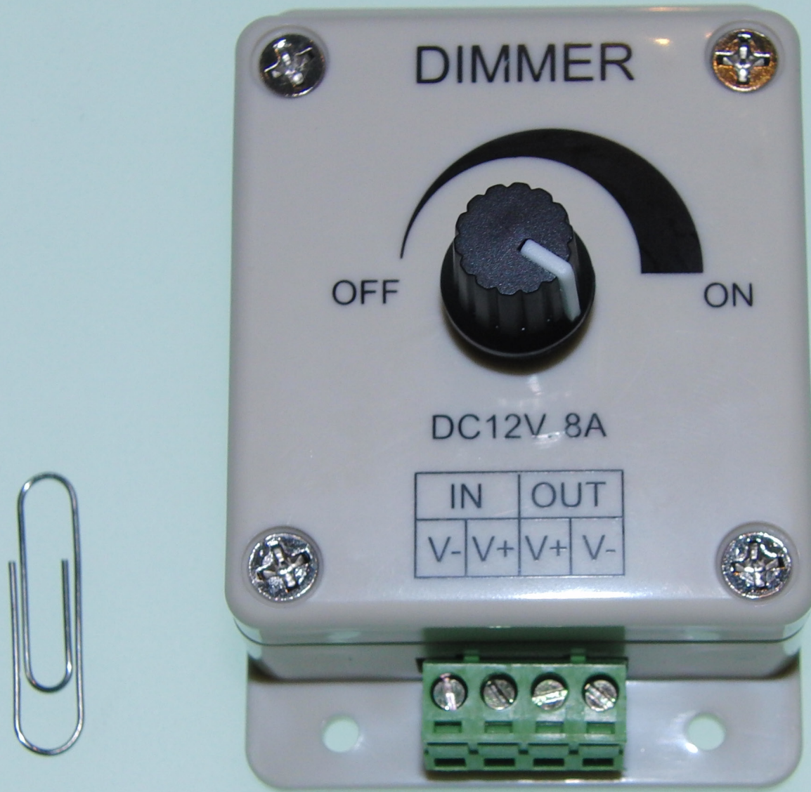
Single Channel 8A LED Dimmer